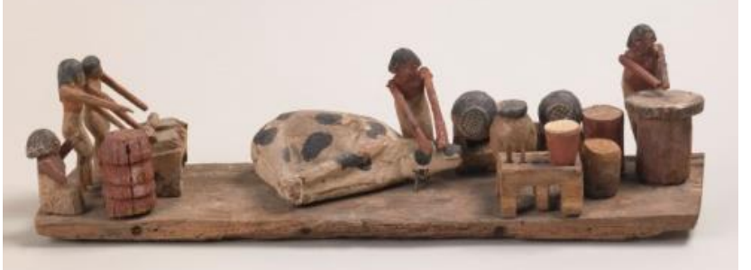
Model of baking, brewing and butchery